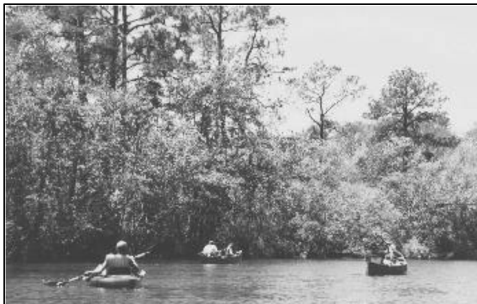
Coastal Mississippi has several streams suitable for floating. Floating can be fun for the whole family when done responsibly.

Coastal Mississippi has several streams suitable for floating. Although these streams do not offer the excitement of the fast-flowing whitewaters located to our north, they do offer the floater a beauty and grandeur that is hard to beat. Majestic swamps, bottomland hardwoods, salt marshes, rivers, bayous and even the off-shore barrier islands can be explored by a paddler (dependent, of course, on the paddler's degree of experience).