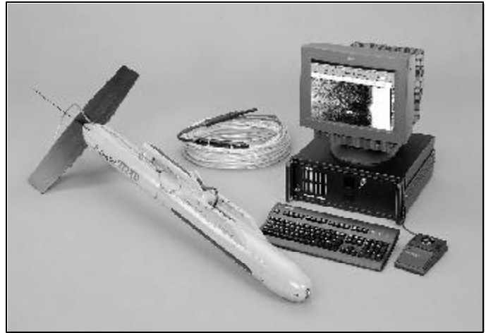
EdgeTech's 560A Series side-scan sonar unit allows imaging of large areas of the Mississippi seafloor.

Information collected by side-scan sonar