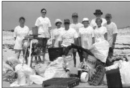
A group of volunteers on Petit Bois Island show off their 2002 Mississippi Coastal Cleanup T-shirts, featuring the artwork of Ocean Springs artist, Walter Anderson. Each cleanup volunteer received a T-shirt compliments of Chevron Pascagoula Refinery.

City of Biloxi, Club Caribbean Divers, Da Beach House, Dole Fresh Fruit, Family of Walter Anderson, Gulf Coast Medical Center, K99FM and Magic 93.7FM, Knight-Abbey Commercial Printing & Direct Mail, Lamar Advertising of South Mississippi, Mississippi Gulf Coast Chamber of Commerce, Mississippi Soft Drink Association, PEPCO, Ship Island Excursions, The Ocean Conservancy, The Sun Herald, Triad Broadcasting Company and WLOX-TV 13.