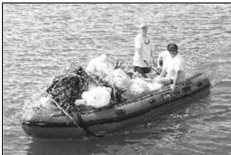
Volunteers head to shore with debris collected on Horn Island. About 60 volunteers ventured out to the barrier islands, despite the threat of Tropical Storm Isidore in the Gulf.

For more info, visit the Mississippi Coastal Cleanup Web site at masgc.org/cleanup .