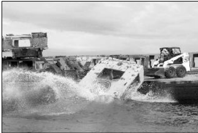
Armored Personnel Carriers are deployed south of Horn Island to enhance artificial reef fishing in Mississippi.

The Mississippi Gulf Fishing Banks acquired 123 APCs through a donation from