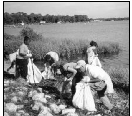
Volunteers from Keesler Air Force Base remove debris along Biloxi's Back Bay.

In Bay St. Louis, the Office of Congressman Gene Taylor and Da Beach House had a cook-out for volunteers. And, Grand Bay National Estuarine Research Reserve held a wiener roast at Shepard State Park in Gautier for volunteers.