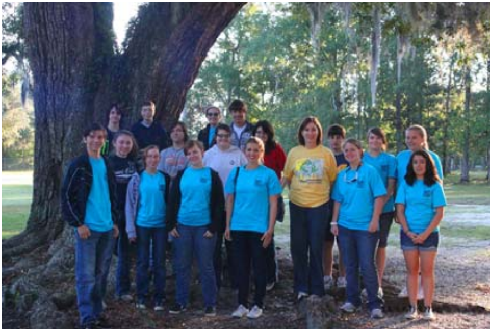
Photo B: Hancock County High School's science club came out in full force early in the morning to help with the 23 rd Mississippi Coastal Cleanup by collecting trash at McLeod Park.