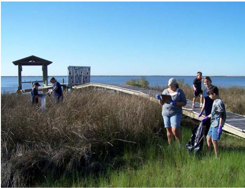
Photo C: An Ocean Springs firefighter and his family help clean up debris from East Beach in Ocean Springs as part of this year's Coastal Cleanup.