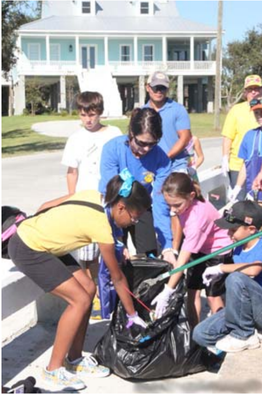
Photo A: Students from North Bay Elementary in Hancock County fill bags full of trash found along the seawall at the beach.