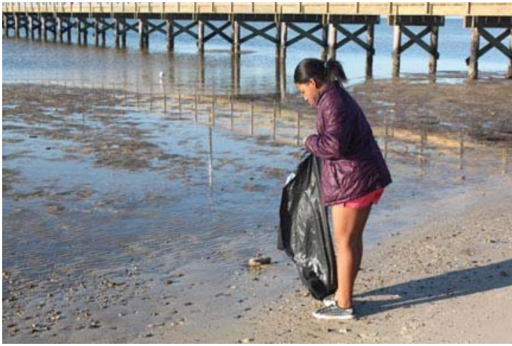
Photo F: A young lady, who is a member of the Boys and Girls Club of the Gulf Coast's East Biloxi Unit, thoughtfully places trash in a bag at the Porter Avenue site in Biloxi.