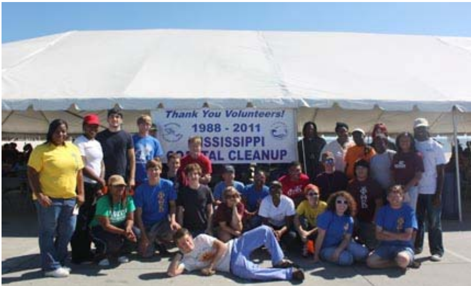
Photo I: A group of 38 students and faculty from Hinds Community College took the 3-hour trip down to the Coast to participate in the cleanup. After collecting trash at the Rodenberg Avenue site, they were among the 550 volunteers who enjoyed a free lunch courtesy of the Gulf Coast Restaurant Group at the Ken Combs Pier in Gulfport.