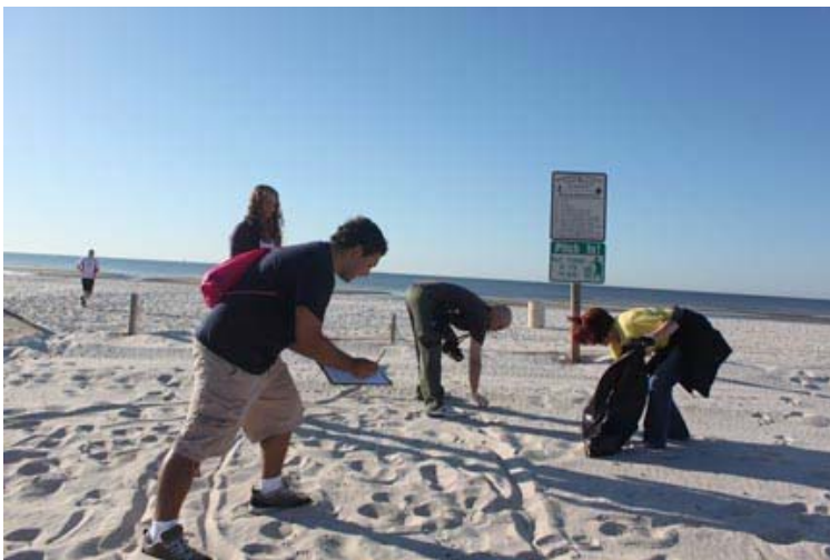
Photo G: At the Rodenberg Avenue site, members of the Phi Theta Kappa honor society at Mississippi Gulf Coast Community College work as a team to collect as much trash as possible in the morning hours.